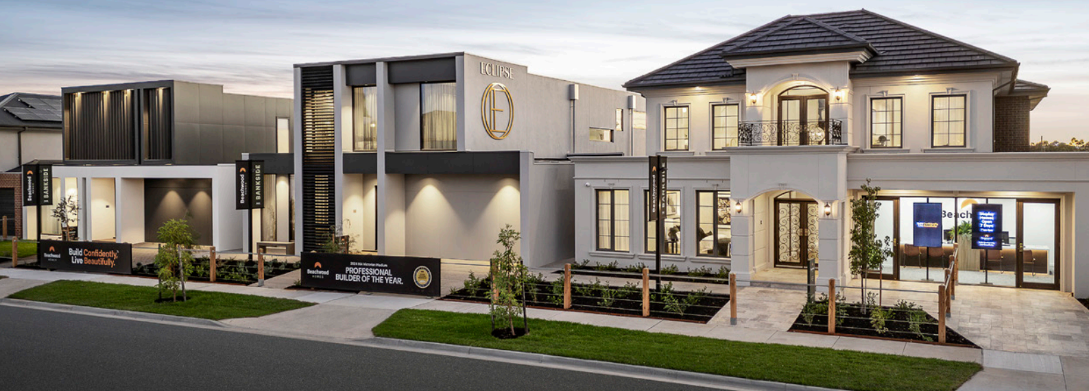
BANKSIDE ESTATE DISPLAY CENTRE

Enquire on our website: beachwoodhomes.com.au