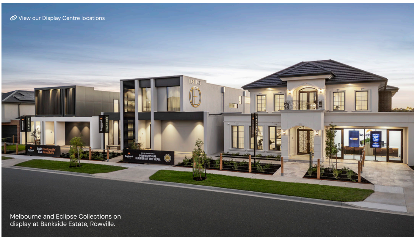
Melbourne and Eclipse Collections on display at Bankside Estate, Rowville.

April 2026 Metro Price List Version 1.0 Issued 1/4/2026. Contact us for Regional Pricing.