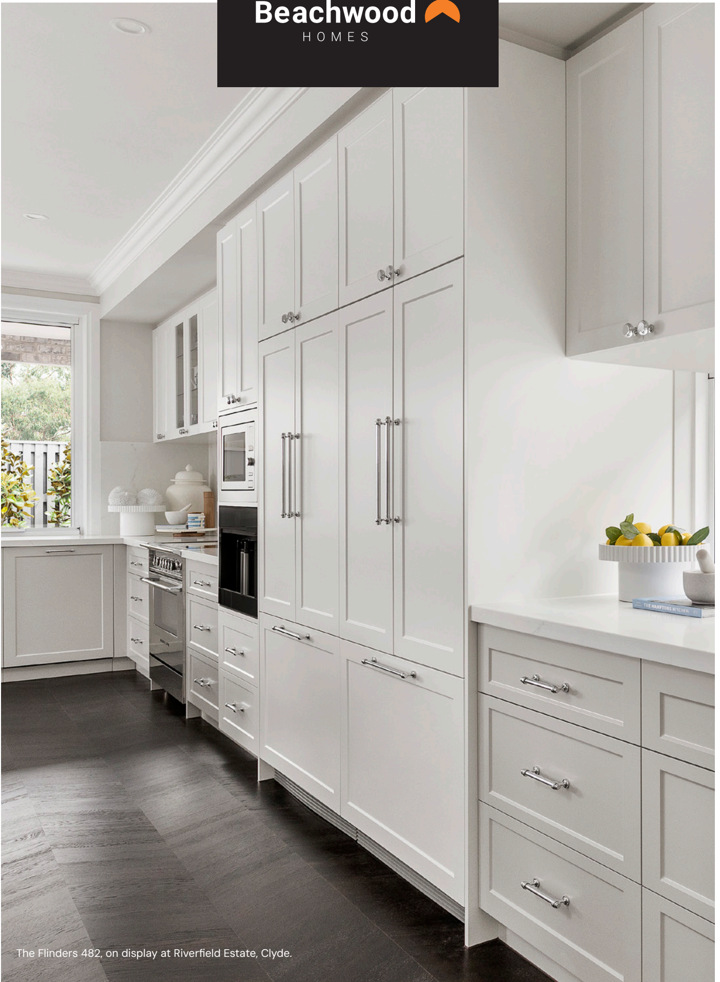
The Flinders 482, on display at Riverfield Estate, Clyde.